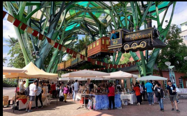
Diudiudang Market (town center)