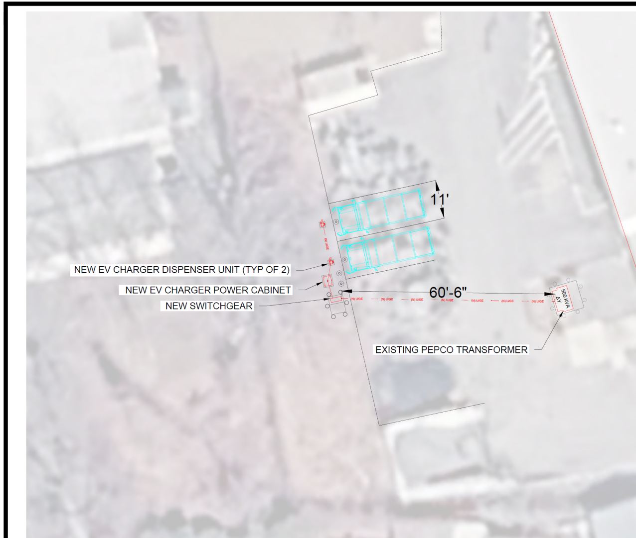
Exhibit B: System Site Plan Address: 14625 Rothgeb Dr, Rockville, MD 20850